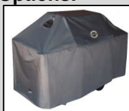
JH-304 Heavy Duty Cover $99