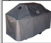
JH-306 Heavy Duty Cover $99