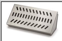
SMOKERBOX $49 JF-306 NG Conversion Kit $129